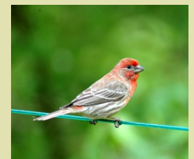
Bird (House Finch) on wire

Heart of the community Radnor Memorial Library (Delaware)