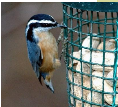
Will you see a Red-breasted Nuthatch this year?

Ongoing —Birdseed Shed at Honey Hollow Env. Ed Center, Bucks County Audubon BCAS.org