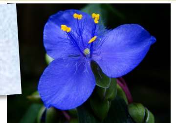
Spiderwort