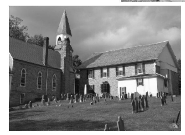
Bill Focht at the cemetery