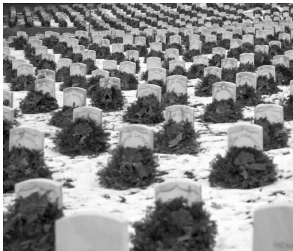
Wreaths at Arlington Cemetery