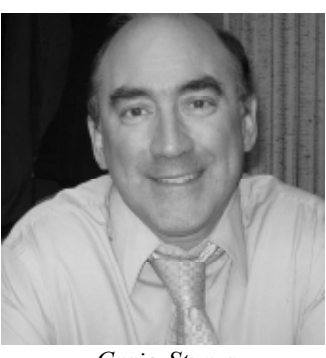
Craig Sturza Borough's budg

The Council of New Britain Borough is a body of seven elected officials who serve without compensation. The role of Council is to oversee all activities of the Borough, including the management of Borough employees. Council is responsible for making policy, passing ordinances, approving contracts and agreements, voting appropriations, approving all personnel deci-