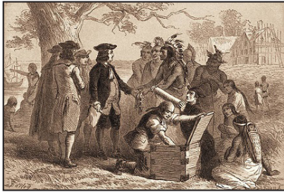
In 1683 William Penn entered into a "Peace Treaty" better known as "Penn's Treaty" with local Indian tribes who were represented by Chief Tamanend.

Many thanks to our dozens of volunteers and all they do throughout the year! Our 2nd Annual Volunteer Appreciation Celebration was held on December 9, 2017 at Burkart Hall. This year's theme was "Chief Tamanend and the Lenni Lenape Indians." Guests enjoyed