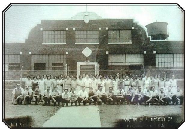
The John Knoell & Sons New Britain Borough factory was originally the Victor Silk Hosiery Company factory. The above photo of Victor factory employees dates back to 1931. The company closed in 1971.