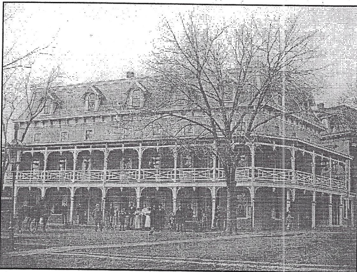
Fountain House, Doylestown, Pa 1894

Bucks County's many inns and taverns are rich in early American history. Everyone is invited to join us for this informative and interesting presentation.